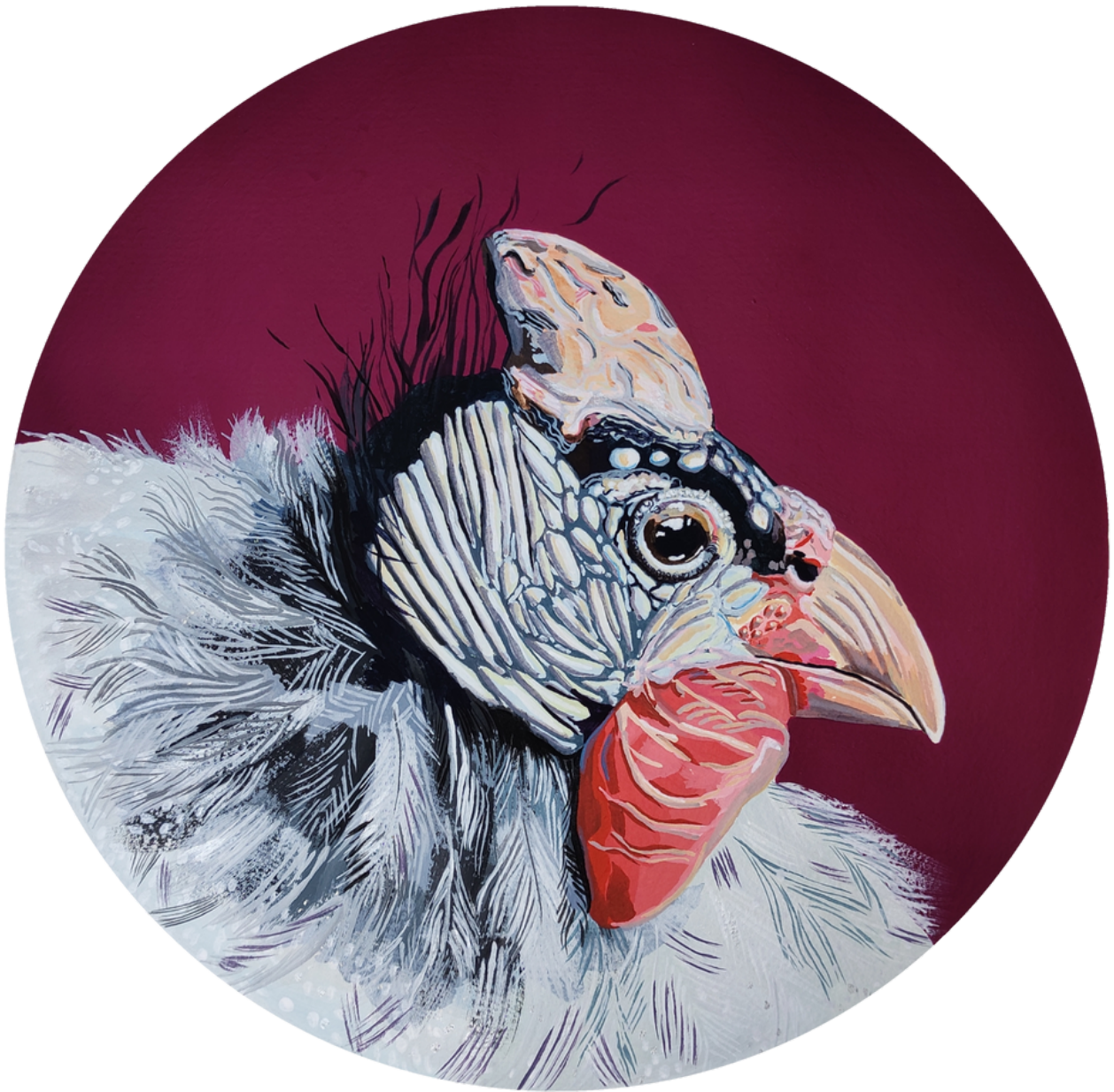
BLUE GUINEA FOWL ON QUINACRIDONE MAGENTA Acrylic gouache on paper, 26.6 x 26.6 cm