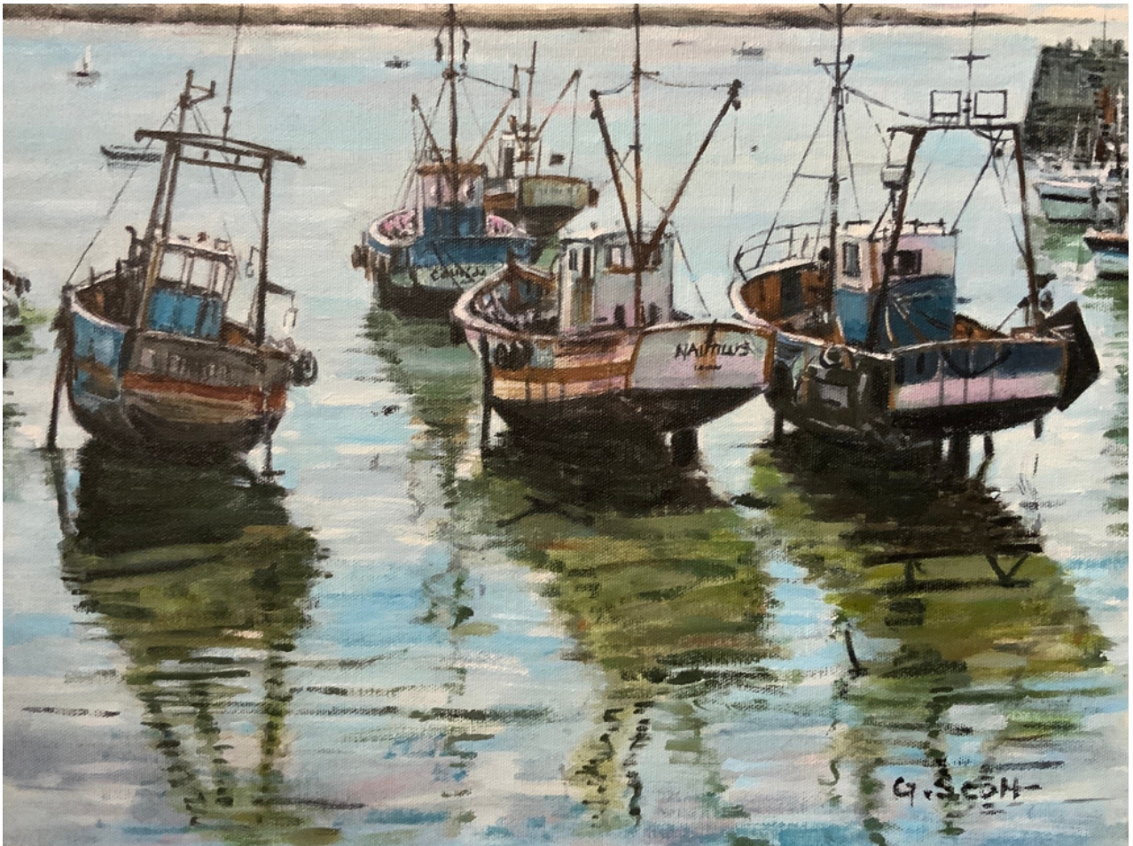
LOW TIDE, ERQUAY, BRITTANY Acrylic on canvas, 48 x 38 cm