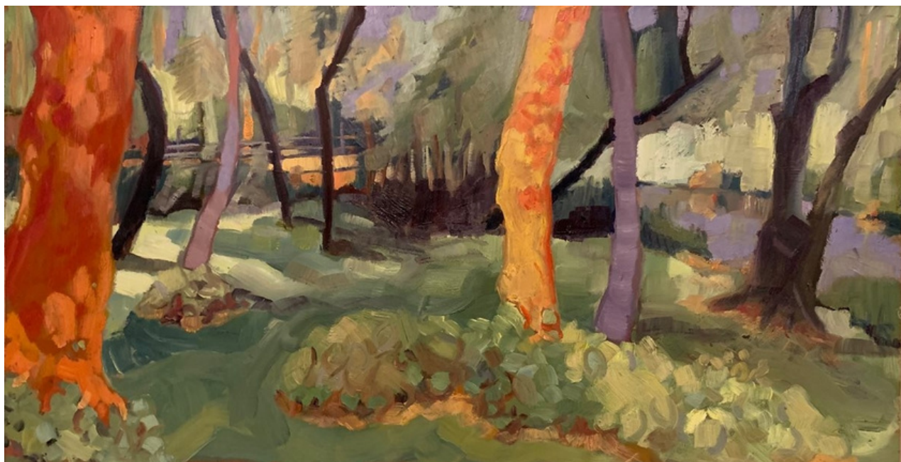
RIVER DEVER UNDER TREES Oil, 42 x 80 cm