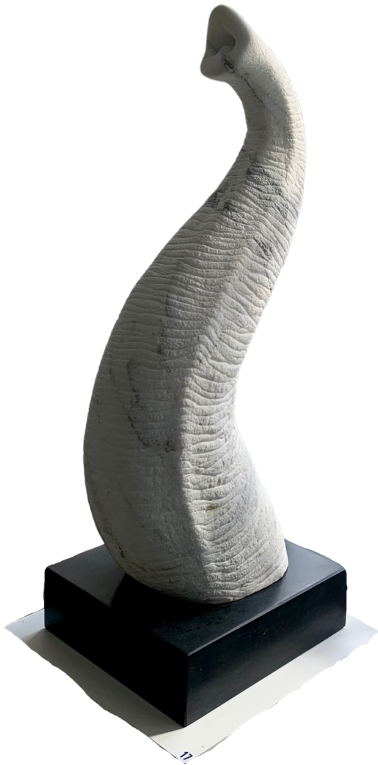
TRUMPETING Arabescato marble, 23 x 70 x 65 cm