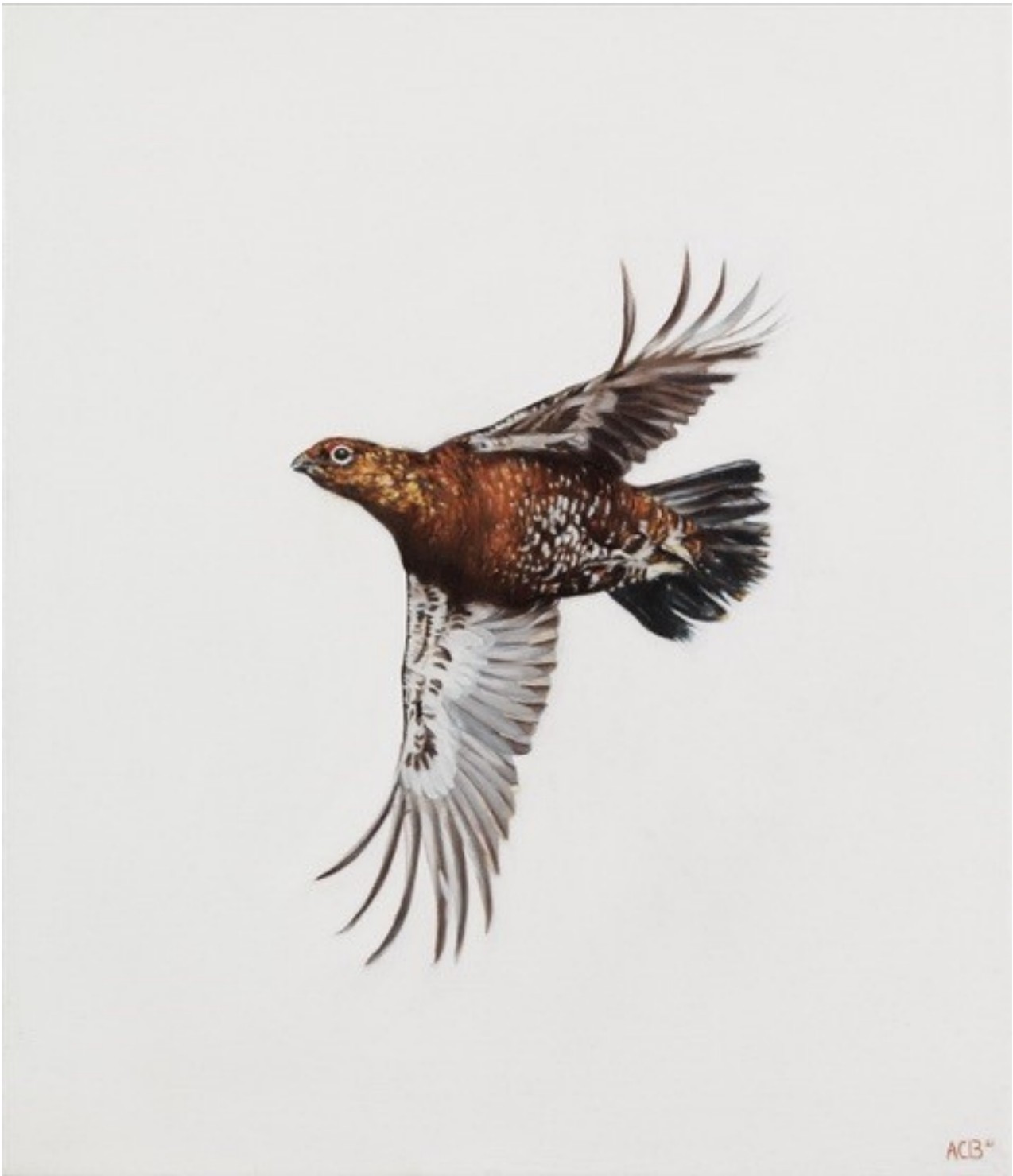
CROSSER STUDY Oil on canvas, 35.6 x 30.5 cm