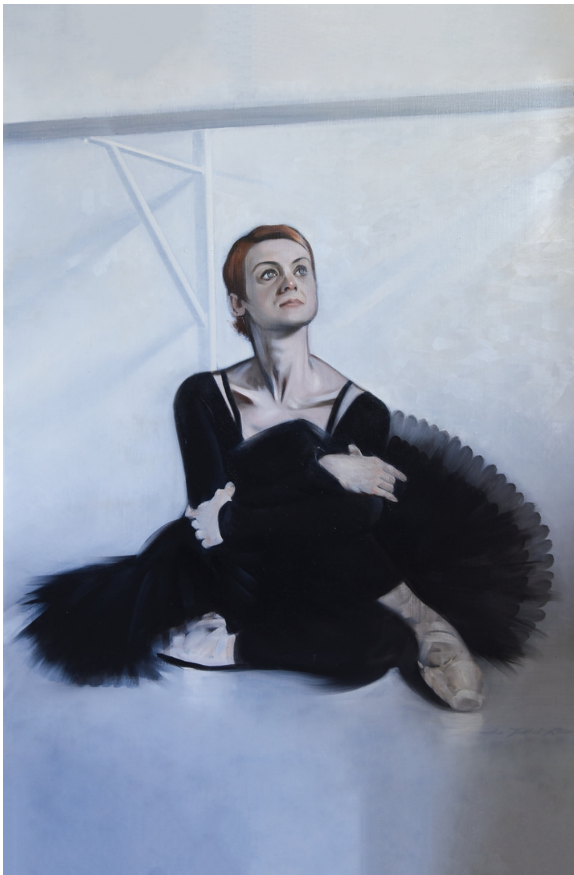
ULIANA LOPATKINA, THE BLACK SWAN Oil on canvas, 63.5 × 58.42 cm