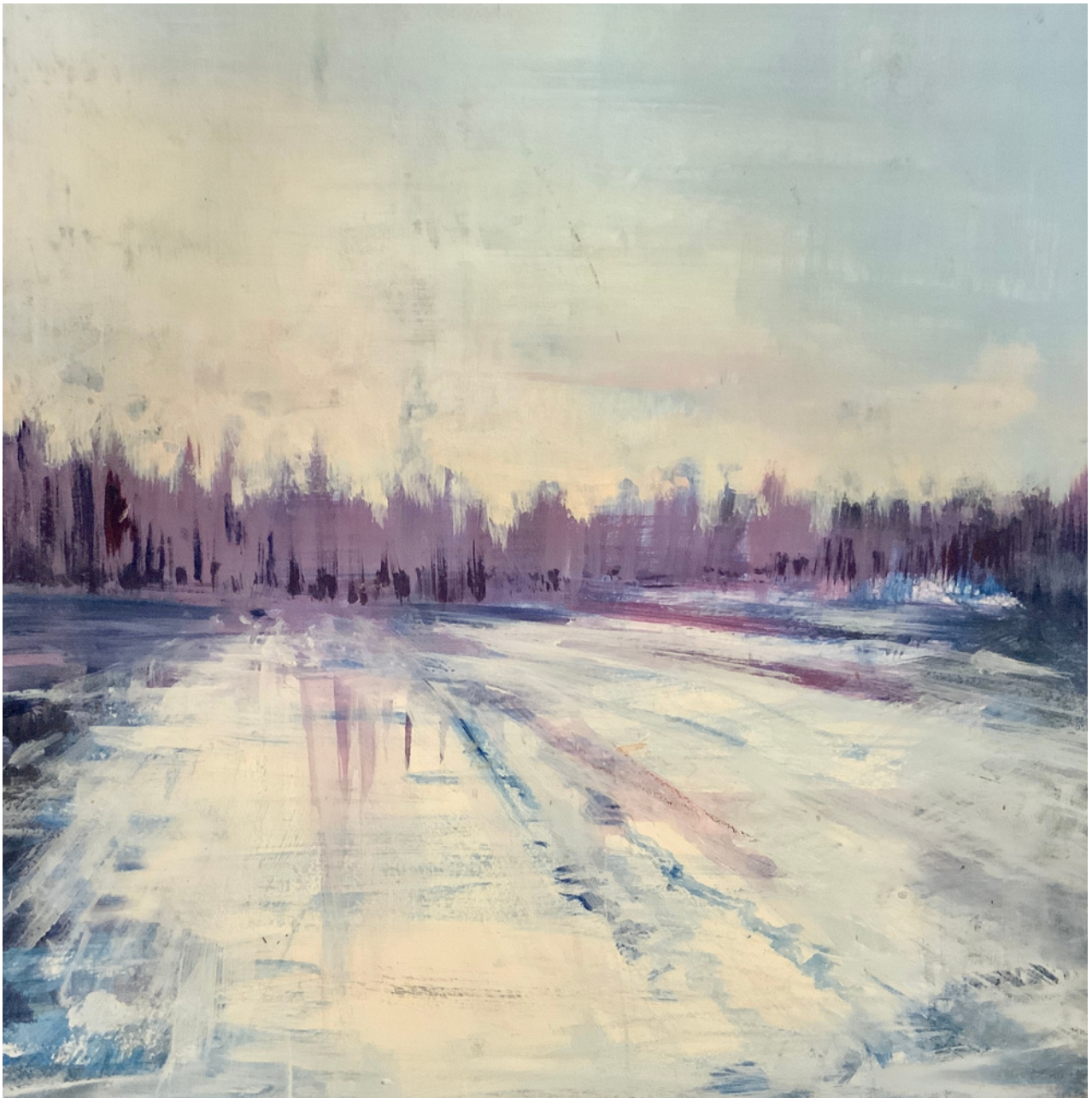
THE BOURBON FIELDS, STOWE Acrylic on canvas, 46 x 46 cm