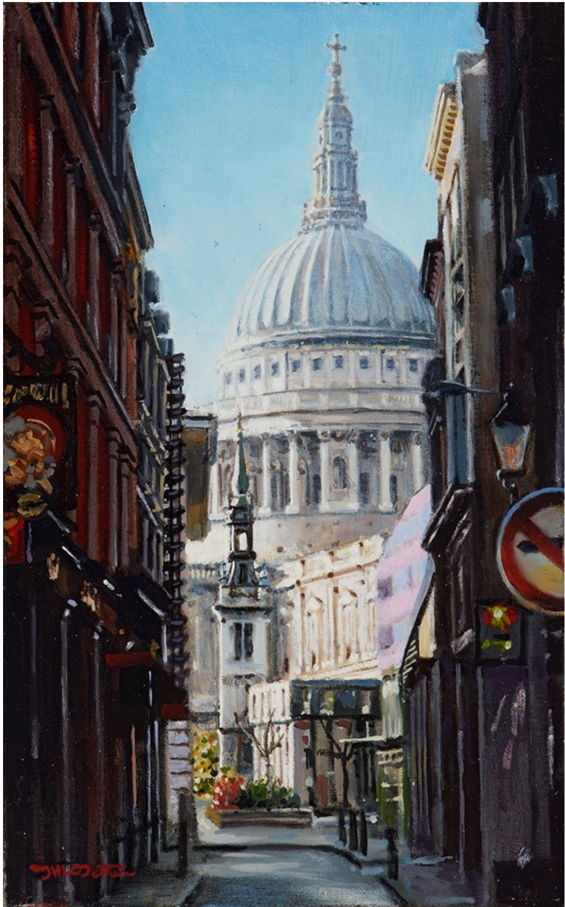
WATLING STREET TO ST. PAULS Oil, 25.4 x 40.6 cm