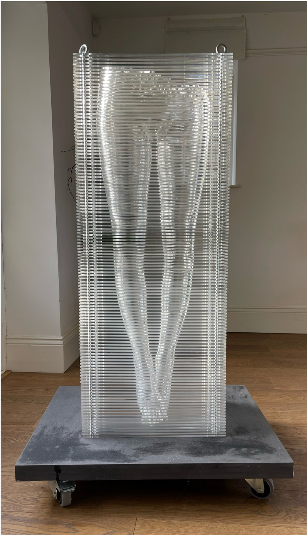
THE WEIGHT OF EMPTINESS. 2022

22 sheets of clear acrylic connected by threaded steel rods capped with industrial lifting eyes