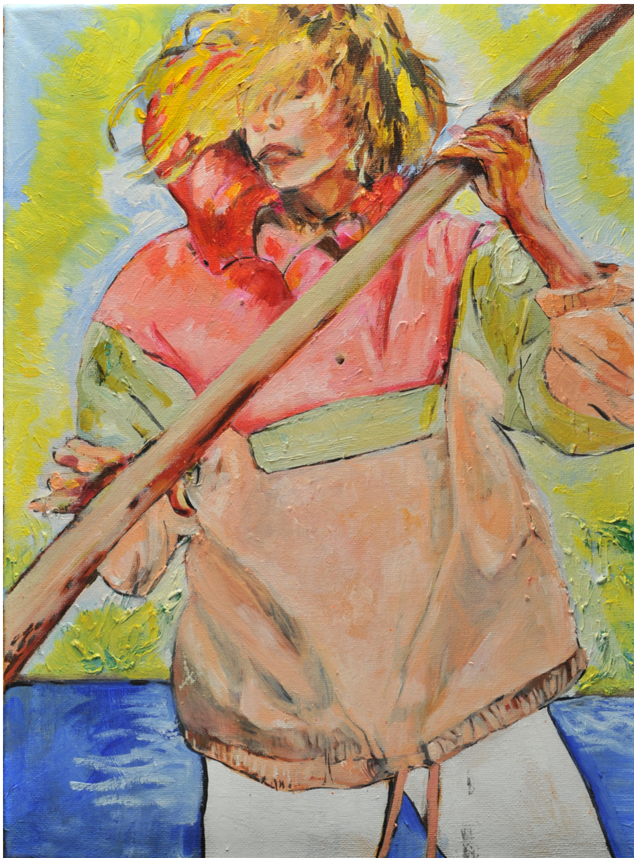
LIVING WATERS Oil, 40 x 30 cm