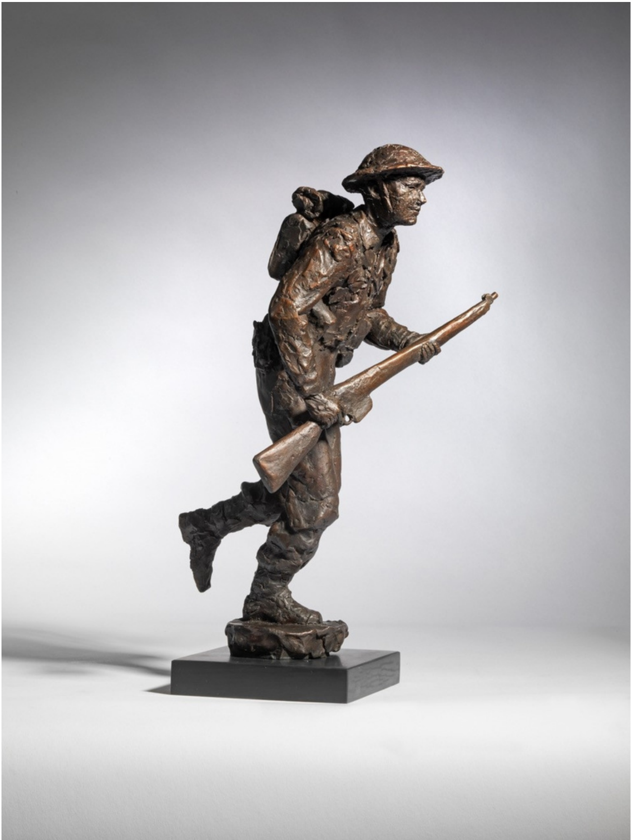
D-DAY MEMORIAL SCULPTURE MAQUETTE, SOLDIER I