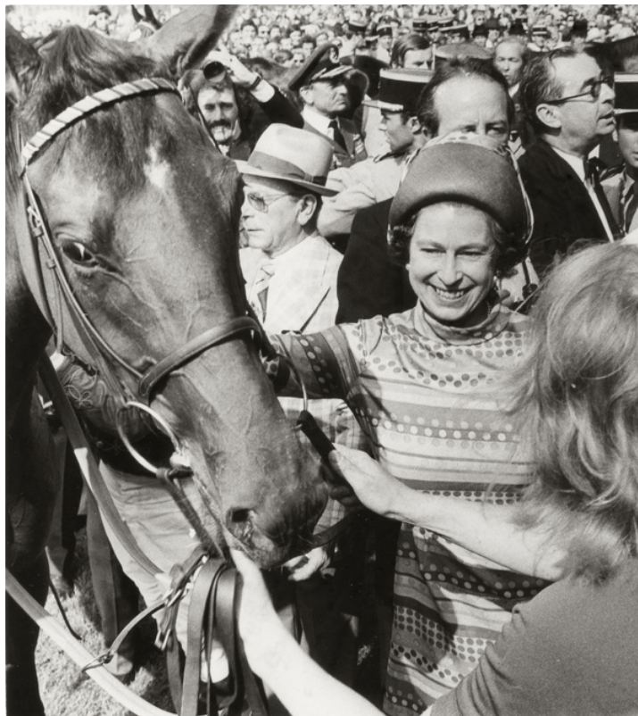
A HAPPY QUEEN CELEBRATING HER WIN OF THE PRIX DE DIANE Chantilly, June 1974. 20 x 15 cm. Original Photograph.