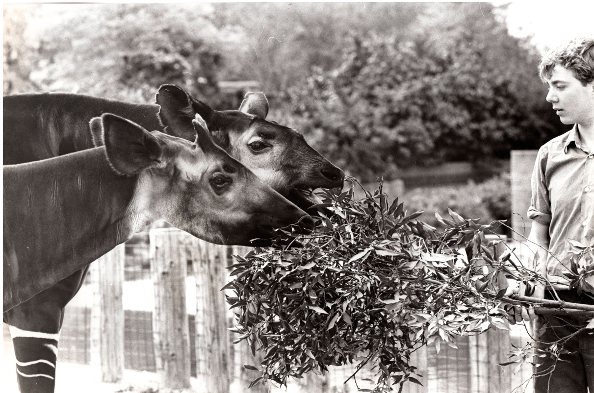
OKAPI, LONDON ZOO

1980. 25 x 38.5 cm. Hand Printed Photograph. © Mark Ellidge