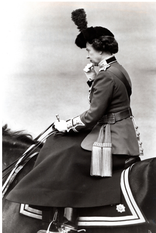
HM QUEEN ELIZABETH II Trooping the Colour, 1983. 30.5 x 20 cm. Original Hand Printed Photograph