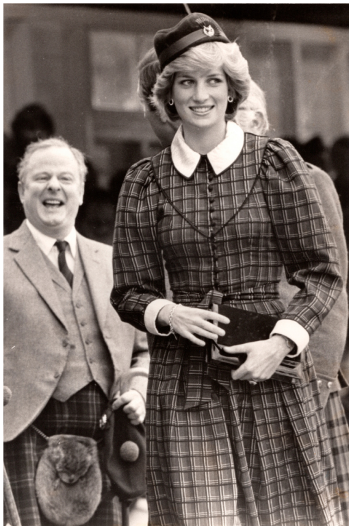
PRINCESS DIANA Braemar Games, 1982. 25 x 20 cm. Original Photograph.