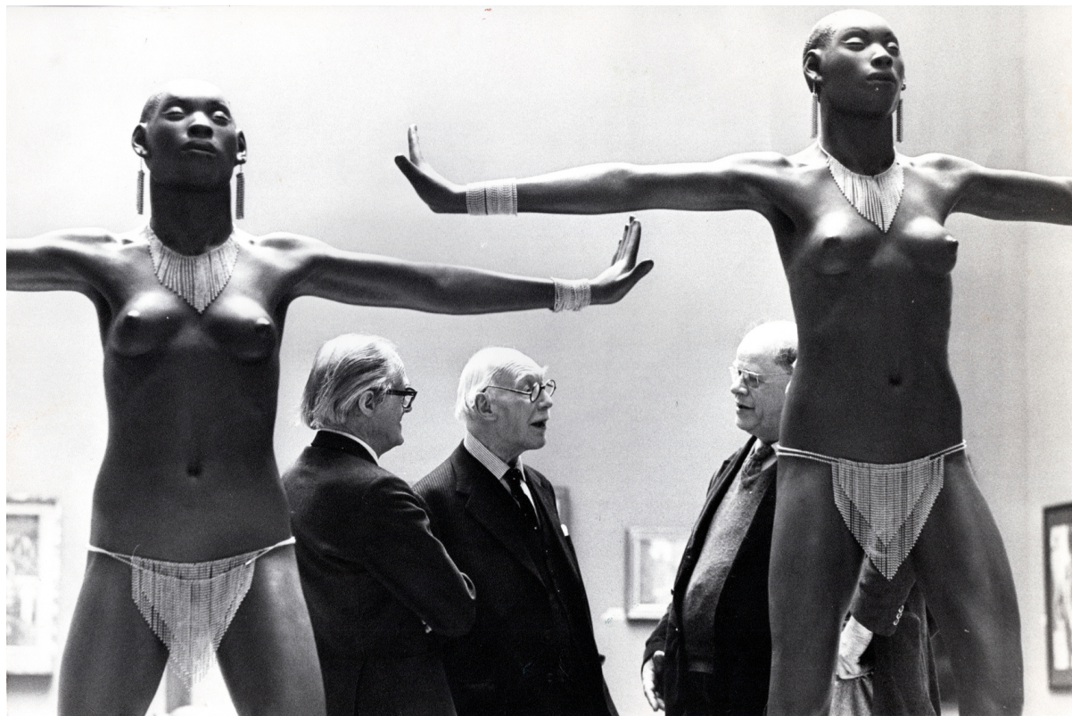
HANGING COMMITTEE AT THE ROYAL ACADEMY 24 x 36 cm. Hand Printed Photograph.