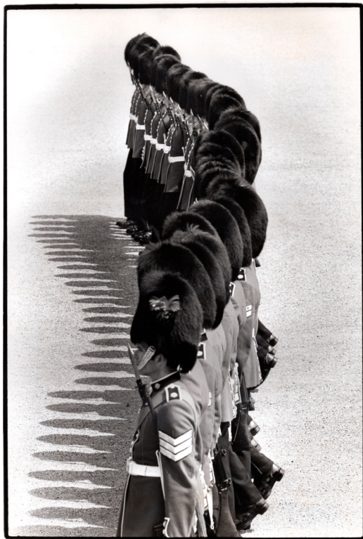
FIRST BATTALION, GRENADIER GUARDS Rehearsal of Trooping the Colour, 1983. 41 x 30.5 cm. Original Hand Printed Photograph