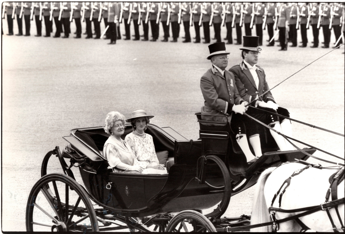
PRINCESS DIANA WITH THE LATE QUEEN MOTHER 1983. 27.5 x 39 cm. Original Hand Printed Photograph