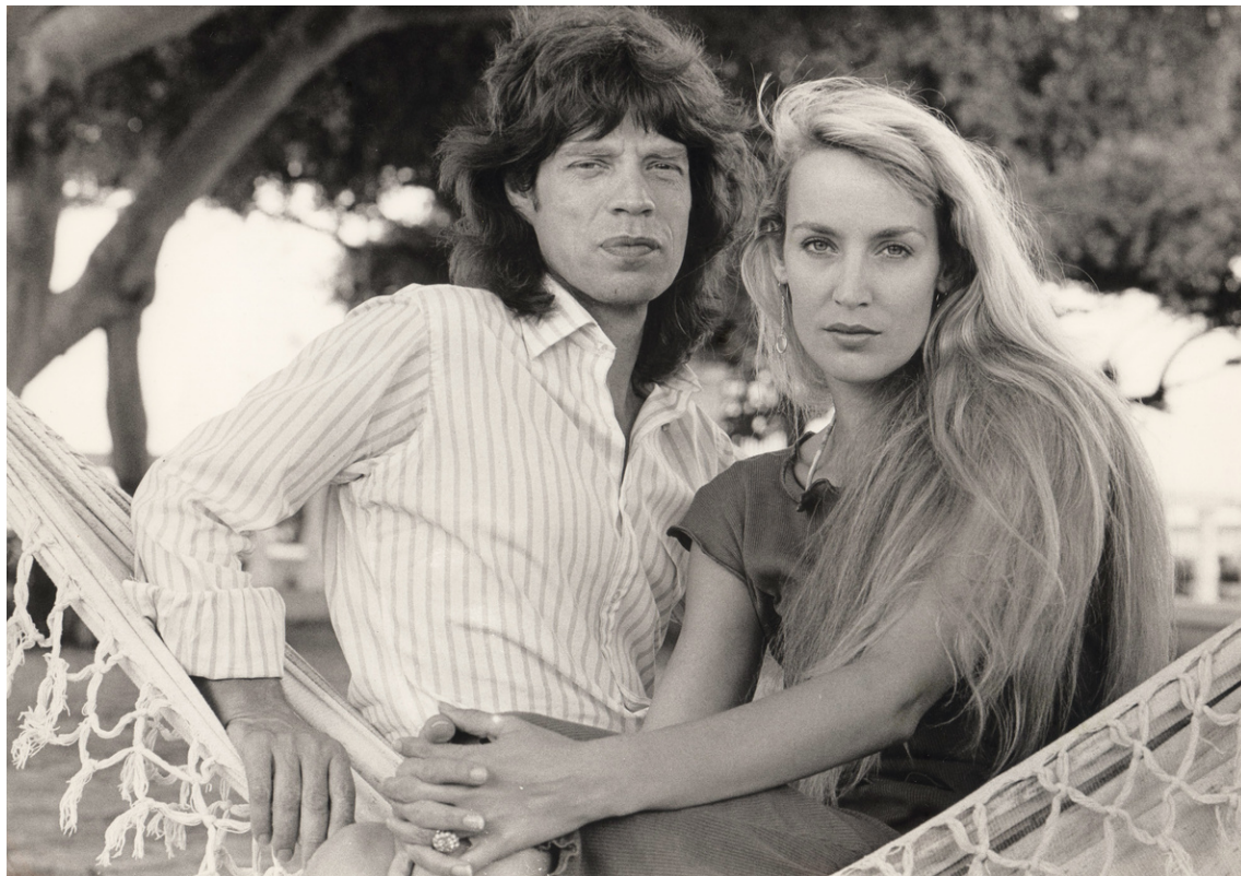
MICK JAGGER AND JERRY HALL, AWAITING HER TRIAL FOR POSSESSION OF MARIJUANA I

Bridgetown, Barbados, 1987. 18 x 25.5 cm. Original Photograph.