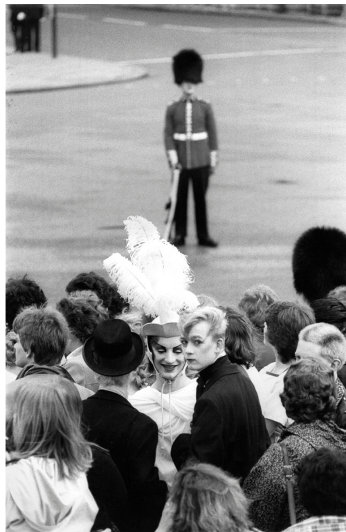
BOY GEORGE AT THE TROOPING OF THE COLOUR 1983. 37.5 x 24.5 cm. Original Photograph