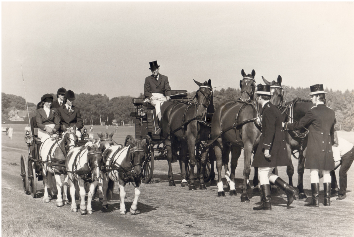
DUKE OF EDINBURGH OUT CARRIAGE DRIVING IN THE PARK c. 1980. 19 x 28.5 cm. Original Photograph.