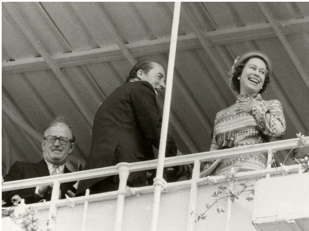
THE QUEEN CATCHES HER BREATH AFTER HIGHCLERE HAS JUST PASSED THE POST

Chantilly, June 1974. 15 x 20 cm. Original Photograph.