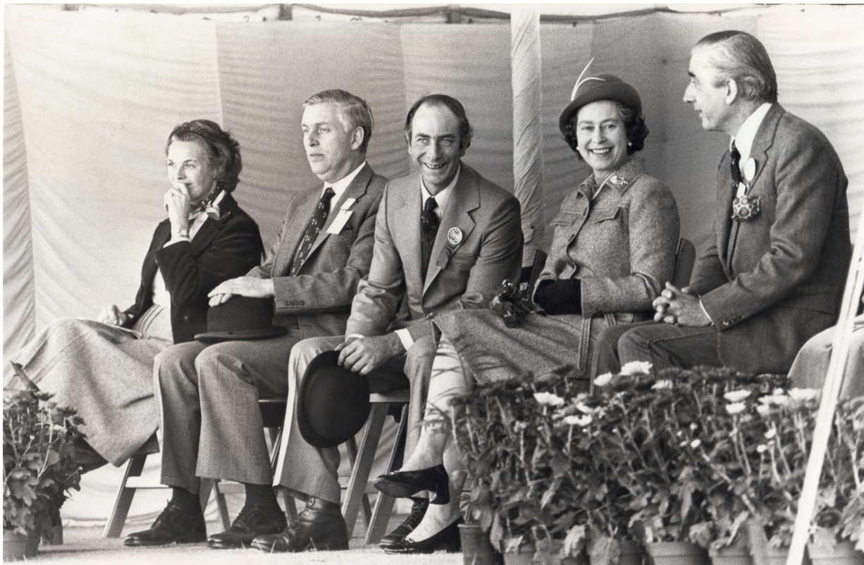
HM QUEEN ELIZABETH II AT THE NATIONAL PLOUGHING CHAMPIONSHIPS 1978. 18.5 x 28.5 cm. Original Photograph