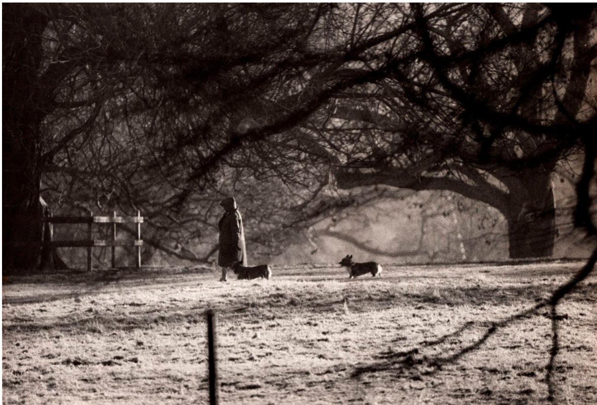
HM QUEEN ELIZABETH WITH HER CORGIS IN WINDSOR GREAT PARK 1983. 27.5 x 39 cm. Original Hand Printed Photograph