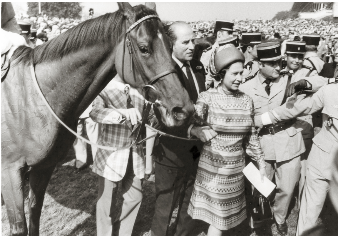
HM QUEEN ELIZABETH II WITH LORD PORCHESTER Chantilly, June 1974. 15 x 25 cm. Original Photograph.