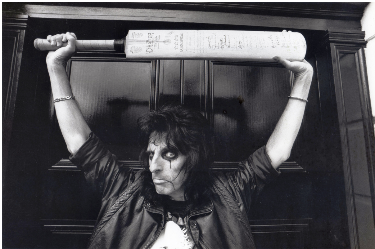
ALICE COOPER BEFORE HIS CONCERT AT WEMBLEY

Lords Cricket Ground, London, 1988. 20 x 29.5 cm. Original Photograph.