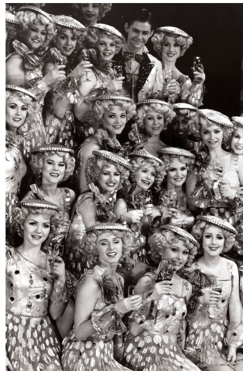
'CHORUS GIRLS' 42ND STREET Theatre Royal, 1989. 40.5 x 30.5 cm. Original Hand Printed Photograph