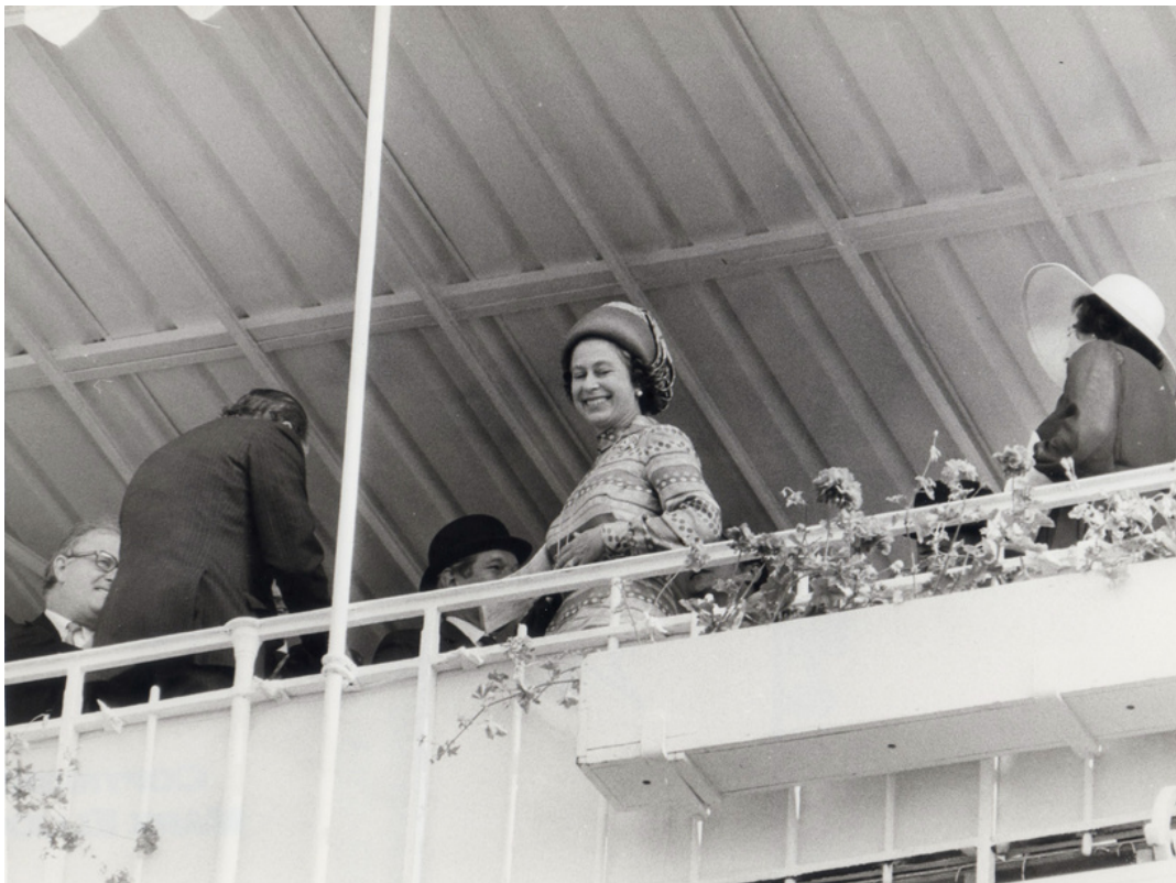
HM QUEEN ELIZABETH II IN THE ROYAL BOX AT THE RACES Chantilly, June 1974. 15 x 24 cm. Original Photograph.