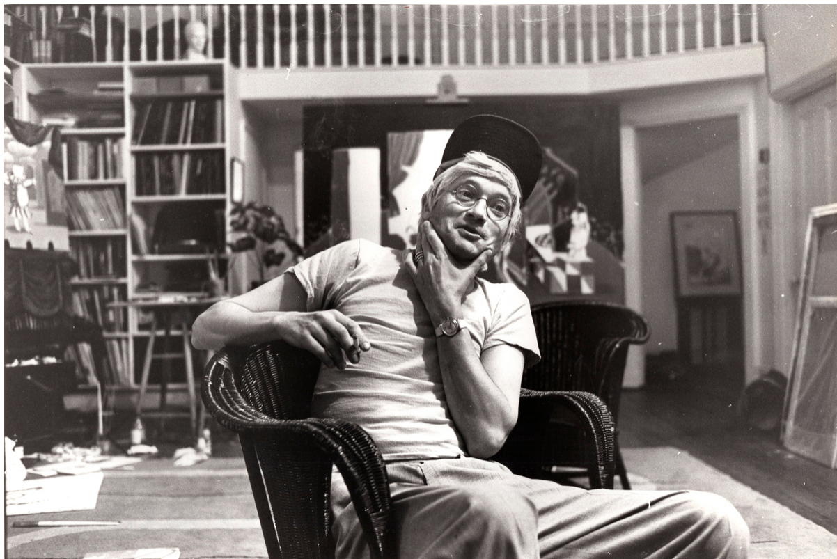
DAVID HOCKNEY IN HIS LONDON STUDIO

July 1980. 25.5 x 38 cm. Original Photograph.