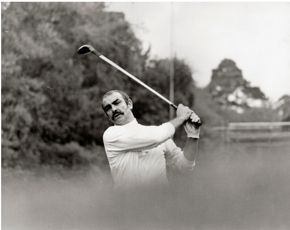
SEAN CONNERY ON THE GOLF COURSE

28 x 36 cm. Original Hand Printed Photograph