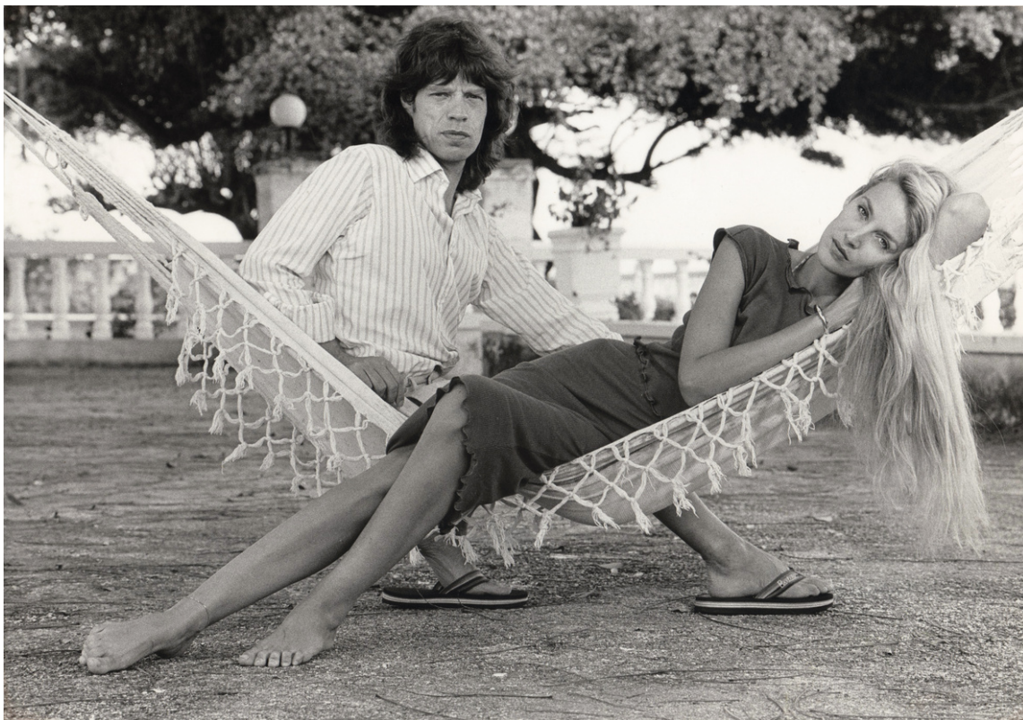
MICK JAGGER AND JERRY HALL, AWAITING HER TRIAL FOR POSSESSION OF MARIJUANA II Bridgetown, Barbados, 1987. 18 x 25.5 cm. Original Photograph.