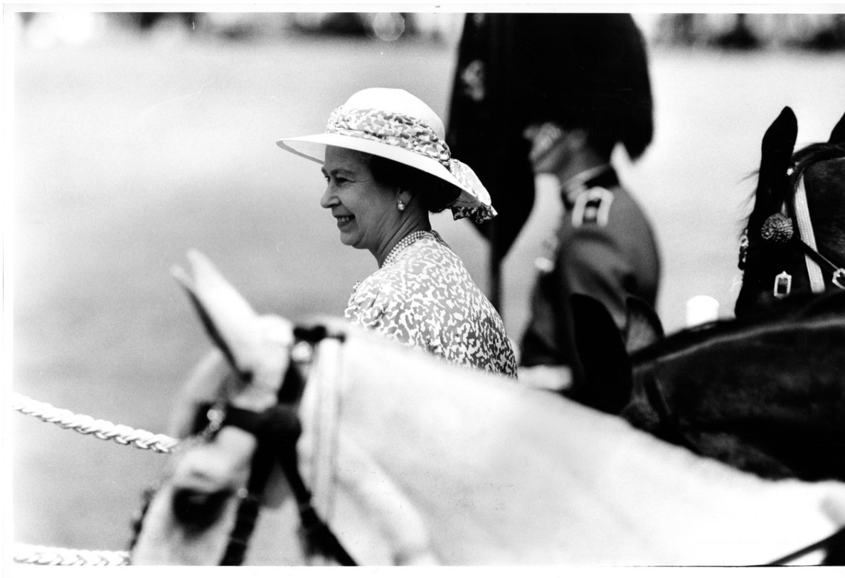
HM QUEEN ELIZABETH II, CLOSE UP

Rehearsal of Trooping the Colour, 1983. 30 x 40.5 cm. Original Hand Printed Photograph