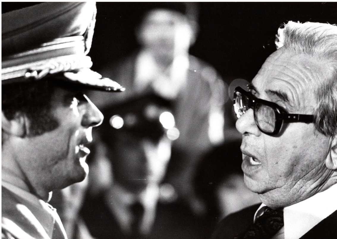
COLONEL GADAFI WITH PRESIDENT ANTON BUTTIGIEG April 1979. 20 x 28.5 cm. Original Hand Printed Photograph