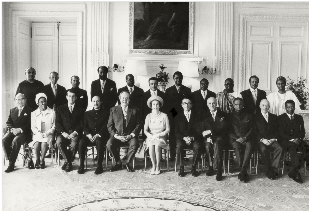
HM QUEEN ELIZABETH II AT VERSAILLES

Versailles, May 1972. 16 x 24 cm. Original Photograph.