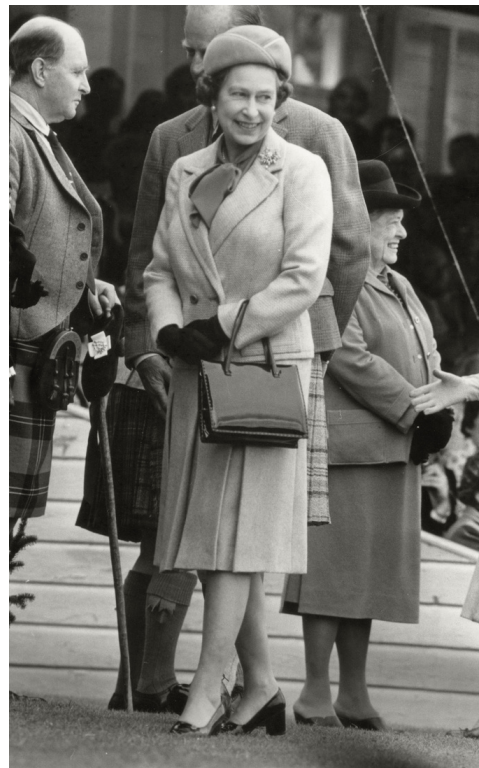
HM QUEEN ELIZABETH II Braemar Games, 1982. 25 x 20 cm. Original Photograph.