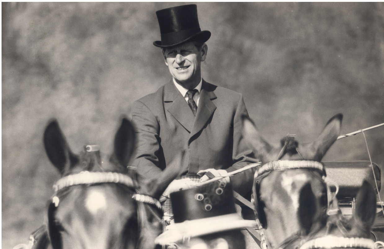
DUKE OF EDINBURGH OUT CARRIAGE DRIVING IN THE PARK c. 1980. 18.5 x 29 cm. Original Photograph.