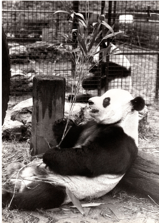
GIANT PANDAS, CHIA CHIA AT LONDON ZOO

They were a present from China. January 1980. 37.5 x 27 cm.