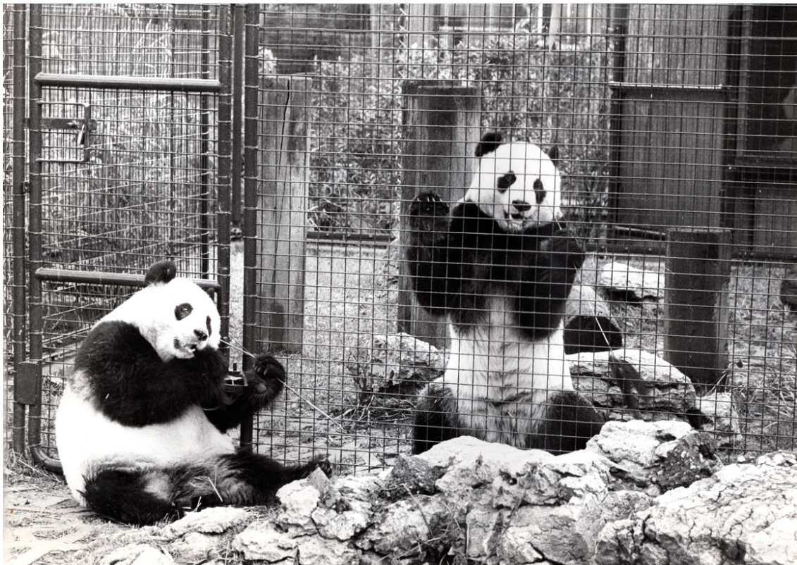
THE TWO GIANT PANDAS CHIA CHIA AND CHING CHING AT LONDON ZOO January 1980. 26.5 x 37.5 cm. Hand Printed Photograph.