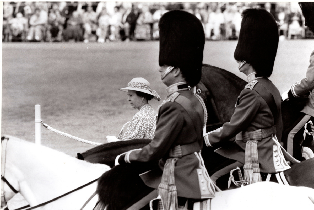
HM QUEEN ELIZABETH II

Rehearsal of Trooping the Colour, 1983. 30 x 40.5 cm. Original Hand Printed Photograph, © Mark Ellidge