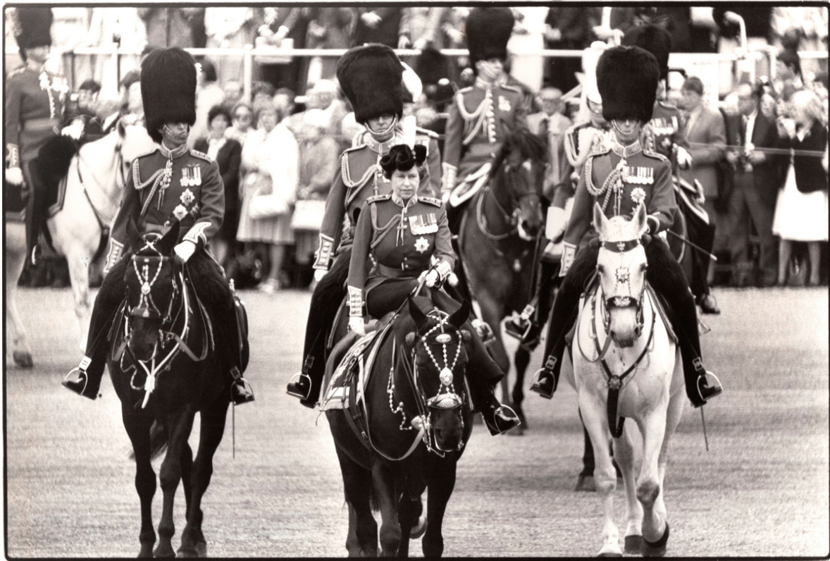
HM QUEEN ELIZABETH

Trooping the Colour, 1983. 27.5 x 40.5 cm. Original Hand Printed Photograph, © Mark Ellidge