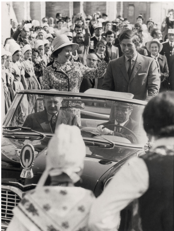
HM QUEEN ELIZABETH WITH PRINCE CHARLES State visit to France. Avignon, 1972. 24 x 17.5 cm. Original Photograph.